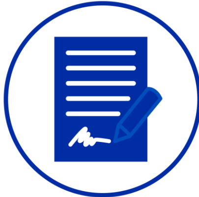
Office of Administrative Services