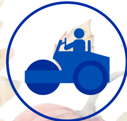
Office of Engineering and Project Management