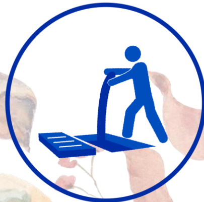
Office of Storm Drain Maintenance