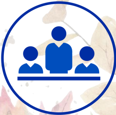
Office of the Director