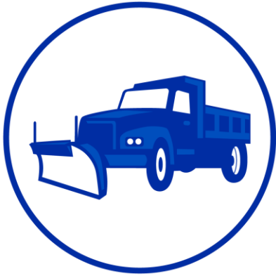
Office of Highway Maintenance