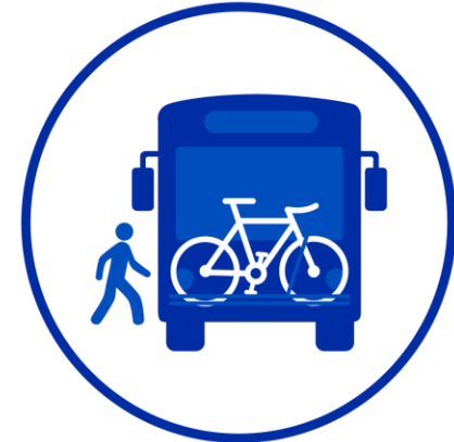
Office of Transportation