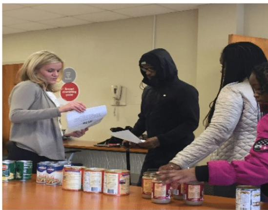
* Number of touches since joining HIA June 2023