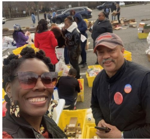
* Number of touches since joining HIA June 2023