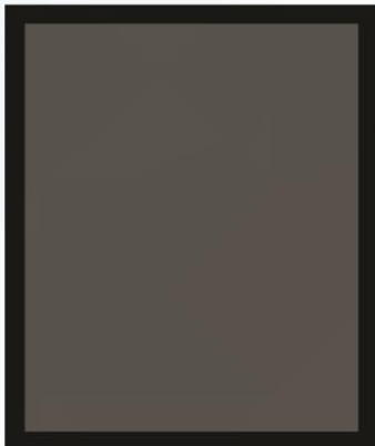
Vacant District 5