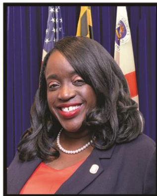
Wala Blegay District 6